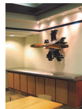
Aircraft engine and propeller on loan from Wings of Eagles.

■ A half-scale model of a glider on loan from the National Soaring Museum, which is the centerpiece of the café seating area.