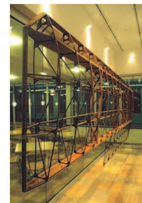
Antique wing frame on loan from the Curtis Museum.

The recent redesign of the restaurant space was conceived and managed by Johnson-Schmidt Architectural Associates of Corning, and features artwork and flight-related objects on loan from the three regional aviation institutions. Among the donated items now featured in the new restaurant space are: