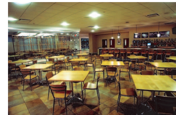
The Passenger Lounge features photos on loan from the National Soaring Museum.

■ Historic images borrowed from the National Soaring Museum are mounted above the bar, telling a story about the Schweizer family.