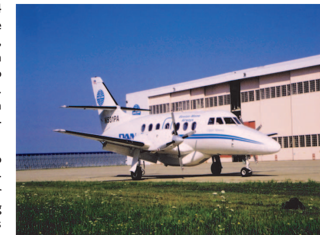
Pan Am Clipper Connection flies a fleet of Jetstream 3100, 19-seat turbo-prop aircraft on all of its NE routes.

Elmira Corning Regional Airport has served the Southern Tier of Central New York and Northern Tier of Central Pennsylvania since 1945. Through the Pan Am Clipper air service, the Airport can now provide convenient access to major urban areas while maintaining the advantages of a small, regional airport: ■ No "big airport" hassles