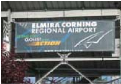
Airport signage at the paddock at the Watkins Glen International Speedway.