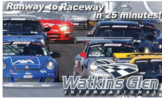
The Airport's Web site at www.eairport.com currently features an image and link to the WGI Web site.

The WINK 106/ WiNGZ 104.9 Pride Ride 2007 passed through five counties during the 160-mile motorcycle excursion across Northern Pennsylvania and through the Southern Twin Tiers of New York. Riders brought new, unwrapped toys as a donation to the Twin Tiers "Toys for Tots" program, and the Ride concluded with a parade style entrance onto