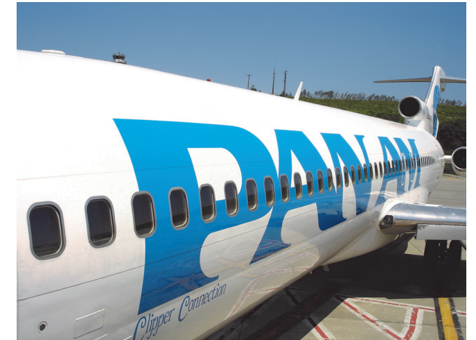
Pan Am Clipper Connection's 727 jet service to service to Orlando Sanford International Airport begins November 19.

In addition, Pan Am Clipper Connection provides the leisure traveler with convenient options in vacation planning. The airline's in-house travel partner, Pan Am Holidays, has a range of vacation packages available. Packages to Orlando/Sanford, Florida are available for as low as $389.00 per person, based on double occupancy. Packages include airfare, car rental and a range of accommodation options. For more information, see the article on page 2 or contact Pan Am Holidays at 877-766-2260.