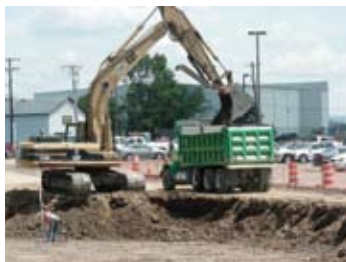
Counterclockwise from left: underground stormwater detention system in place; excavation work underway; FAA cable installed. Every area in these photos will be paved over and become NEW parking.