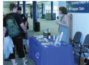
Finger Lakes Wine Country concierge table in ELM terminal.